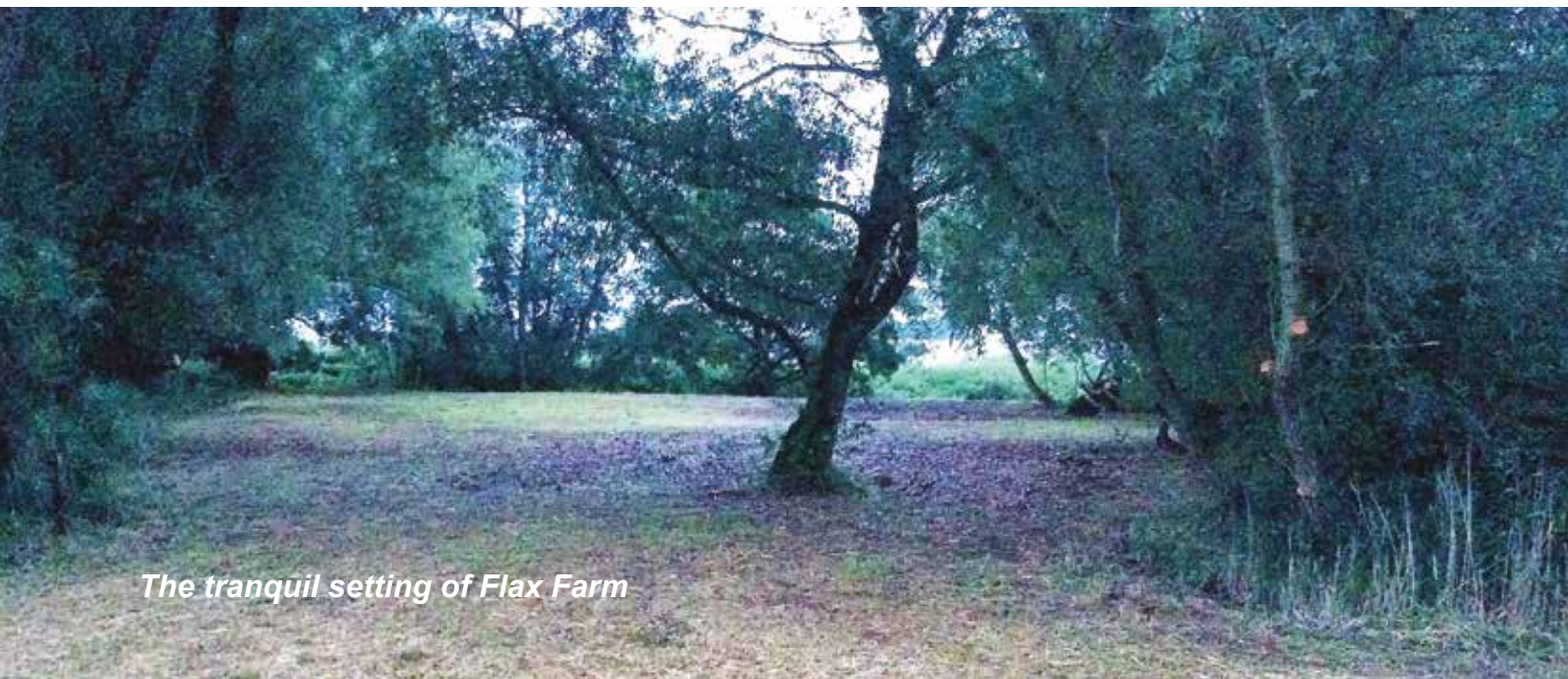
The tranquil setting of Flax Farm